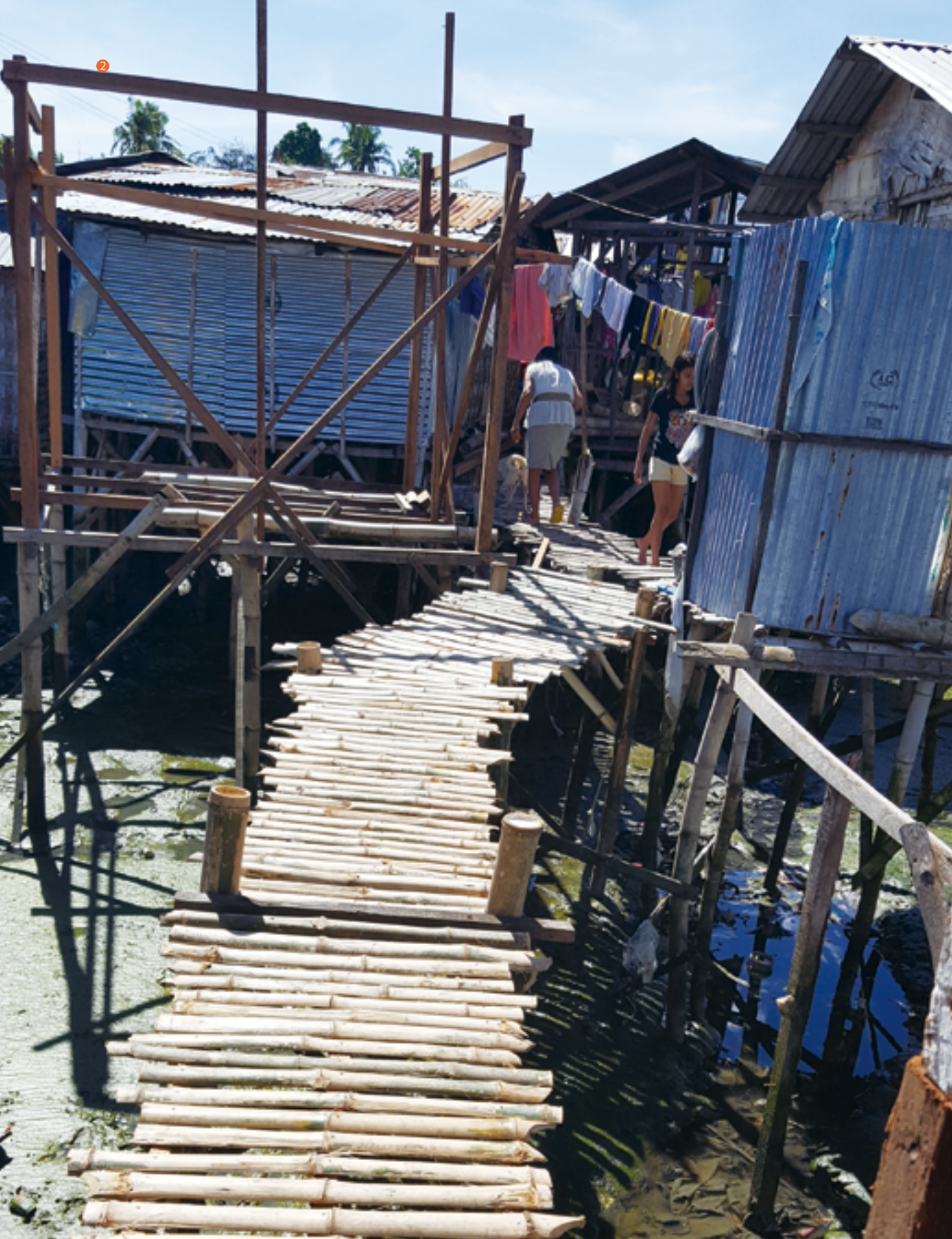
② Newly built bamboo bridge to Dail Community Center