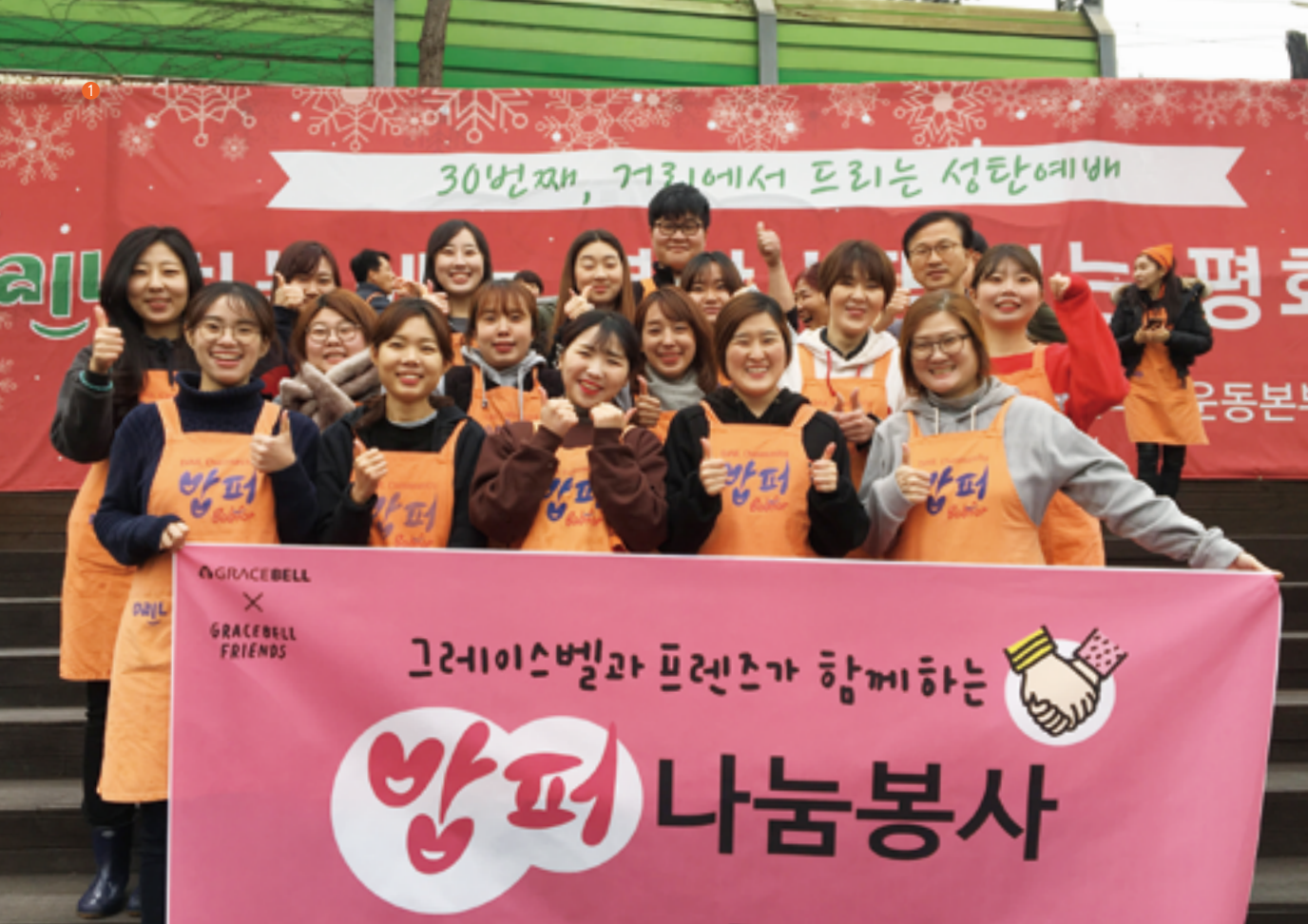
1 Gracebell with Gracebell Friends