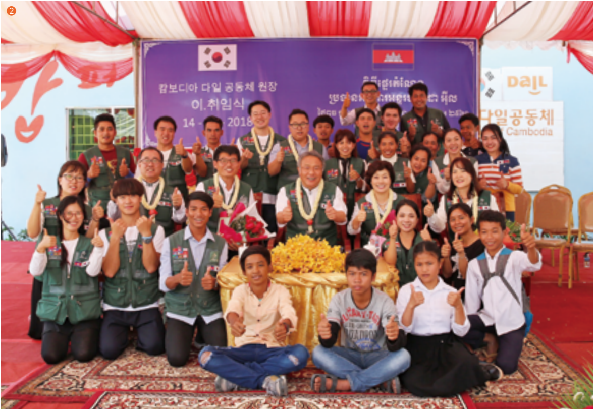
2 Staffs of Cambodia Dail Community