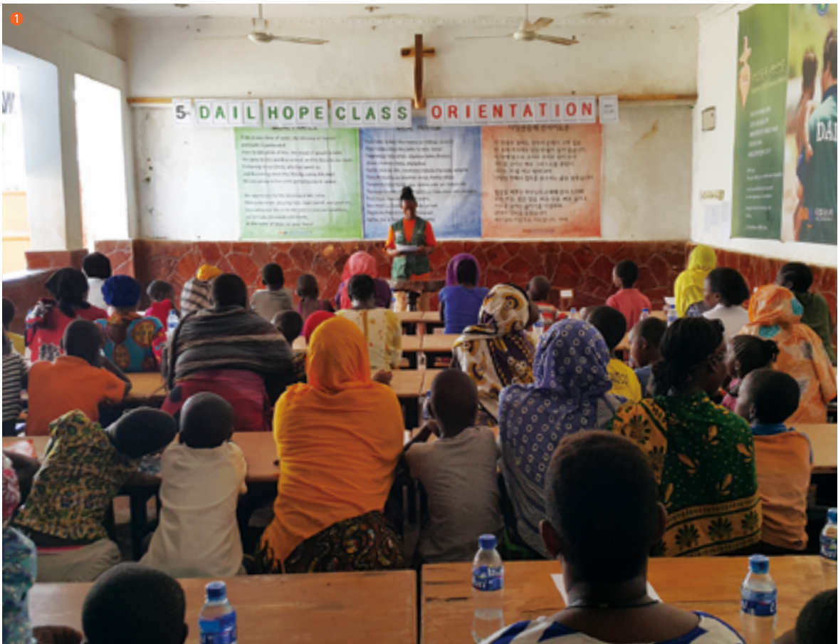
① The orientation for the 5th Dail Hope Class

33 of the 40 children enrolled in the 5th Dail Hope Class do not yet have a sponsor. These children need school uniforms, school supplies, and money for snacks, meals and medical care. In order for these kids to concentrate on their studies, without worrying about anything else, they need to be matched with a sponsor as soon as possible. We ask for your prayer and support for the 33 students of the 5th Dail Hope Class to receive sponsorship very soon.