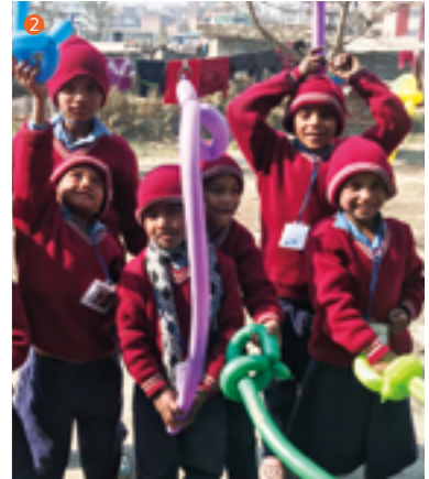
1 Soongsil University Team 2 Kids having a great time with the Soongsil Univ. Team

I'd like to introduce to you a group of young adults who came to Nepal Dail Community from Korea with the passion to serve their neighbors. They are the 34th Soongsil University Impact Team.