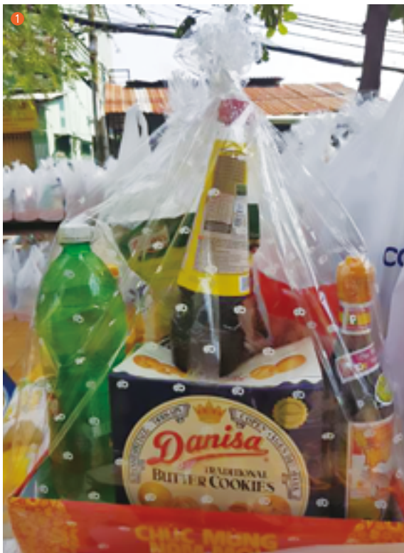
1 Lunar New Year gifts from Vegas