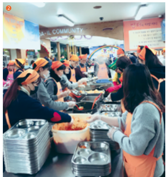
2 Staffs of Gracebell and Gracebell Friends serving food