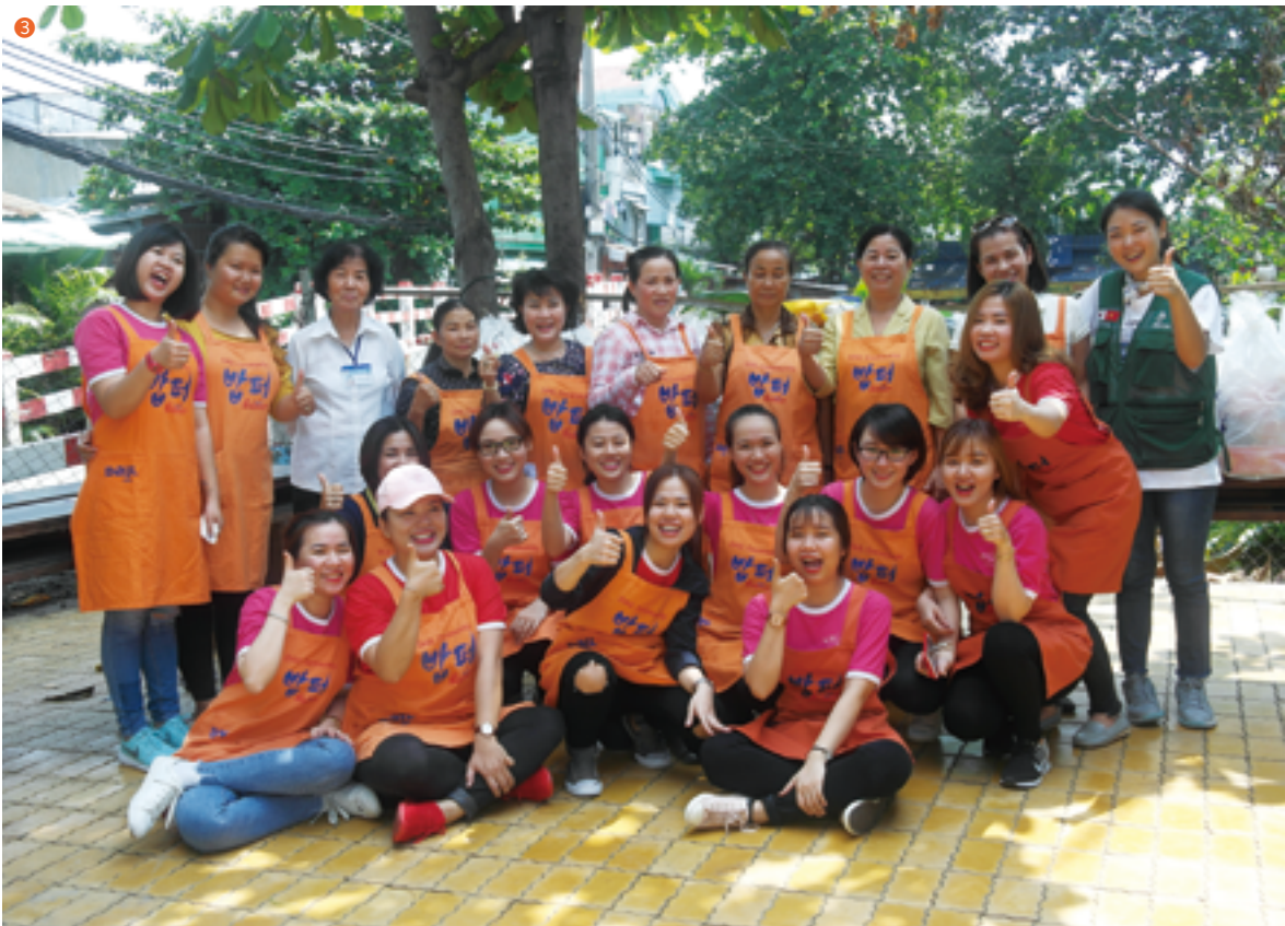
3 Staffs of VEGAS delivering gifts 4 Vietnam Dail Community with VEGAS and Red Cross of Tunheung