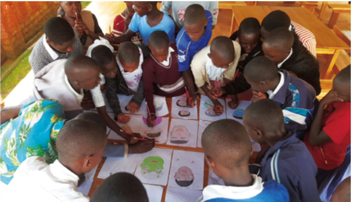
① students drawing their self-portraits