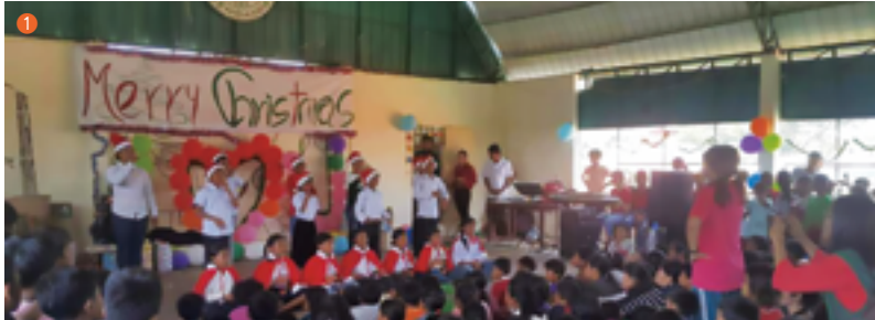
1 Christmas performance